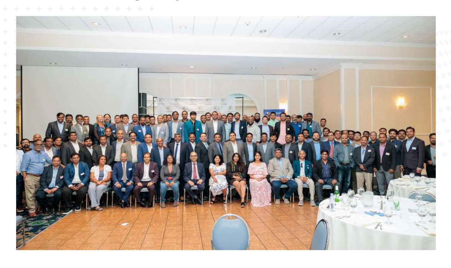
The Columbus Chapter reaches 50 members